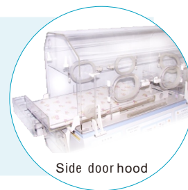
Side door hood