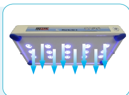
Phototherapy up sideBL-30LED